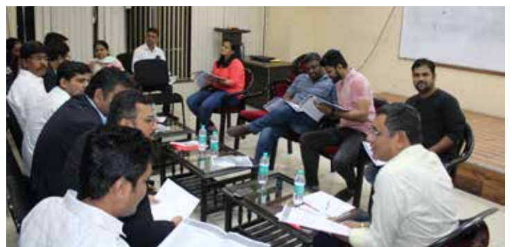
Charting a Path to Success: Vasai Branch, WIRC of ICAI AGM in Pictures