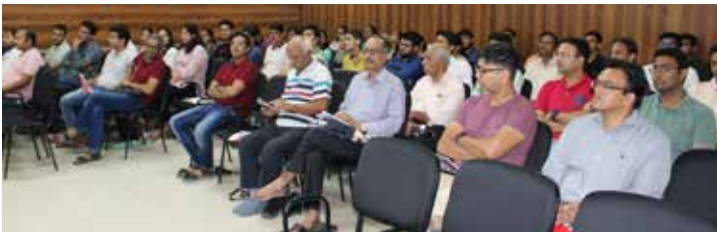
Participants at Seminar on the Whole Gamut of Year End Finalisation (Inc. ITR)