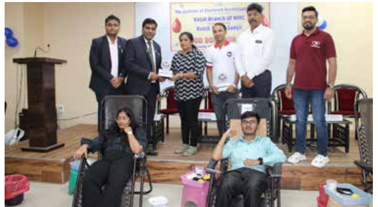
Participant donating blood at the Vasai Branch Blood Donation Camp