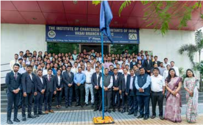
“United in Purpose, Embarking on a Journey of Excellence” A group photo capturing the joyous moment of Flag Hosting on CA Day - 1st July 2023.