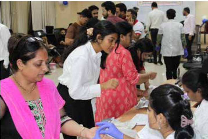
A participant receiving a thorough check-up at the Vasai Branch Blood Donation Camp