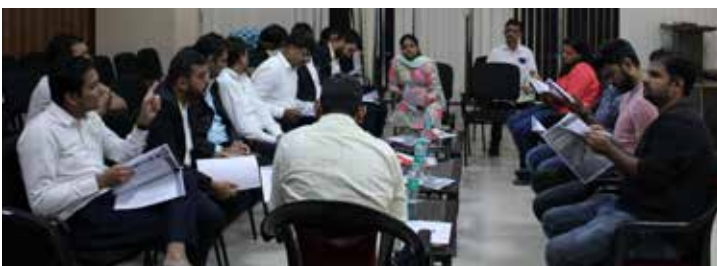
Collaboration and Knowledge Exchange: Annual General Meeting at Vasai Branch