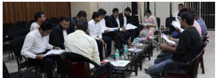
Proud Moments: Capturing the AGM of Vasai Branch, WIRC of ICAI