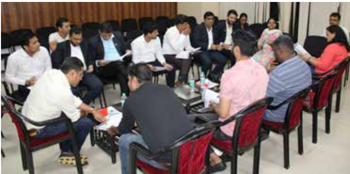
Uniting Minds and Visions: A Snapshot from the AGM of Vasai Branch, ICAI